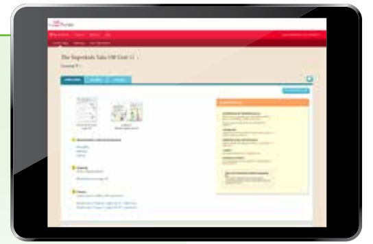
Grade 2, Unit 11