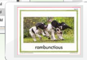
Grade 2, Unit 13 Words to Know Card