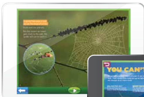
Grade 1, Unit 2 On-Level Library Book