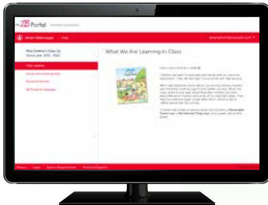
Class Updates Page