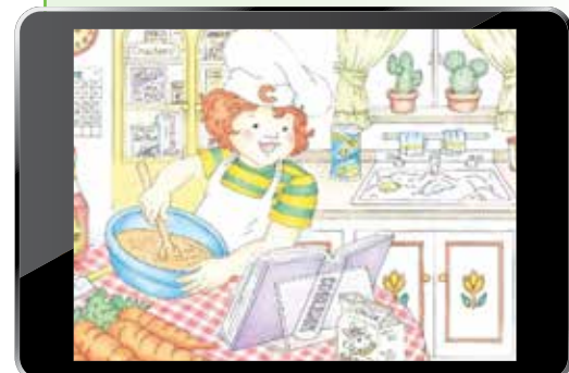
Cass Song Animation

These catchy animated songs introduce the Superkids characters and Superkids' club activities in kindergarten. Each song contains words that include the focus phonemes for the unit and provides opportunities for rich discussion.