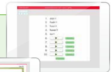
Grade 1, Unit 9 Interactive Daily Routine