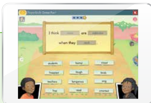
Grade 2 Game