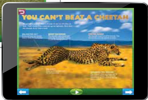
Grade 2, Unit 7 SUPER Magazine